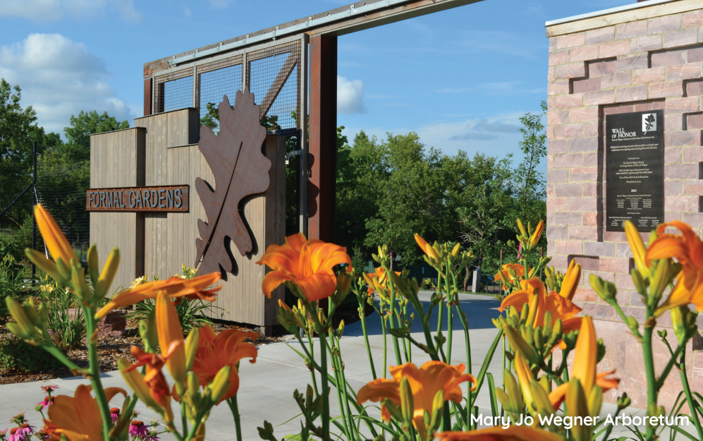
Mary Jo Wegner Arboretum