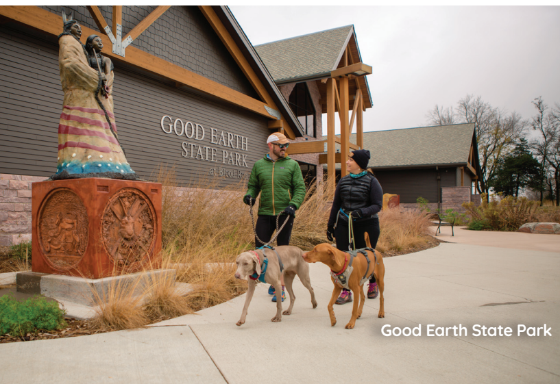
Good Earth State Park

Time: 90 minutes for lunch, Falls Park and Stockyards Ag Experience, 60 minutes if lunch and Falls Park only Admission: Free