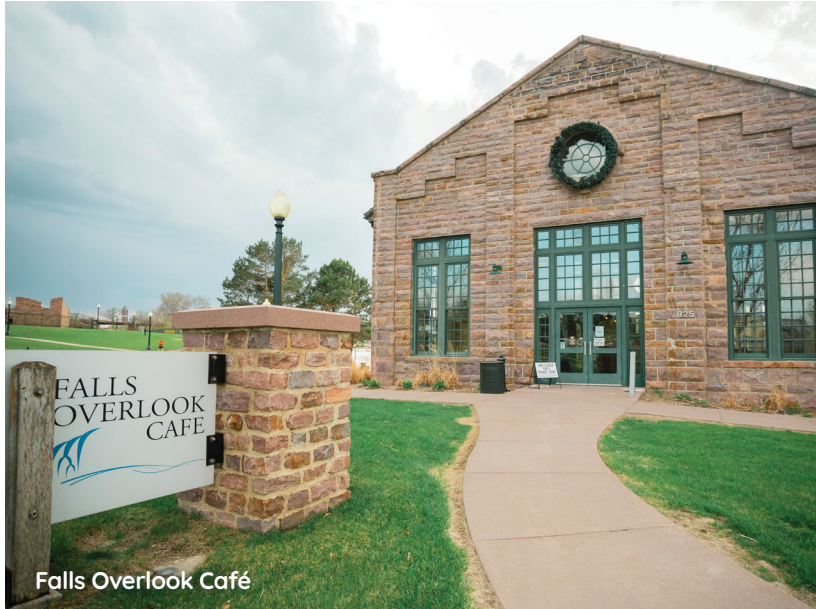
Falls Overlook Café