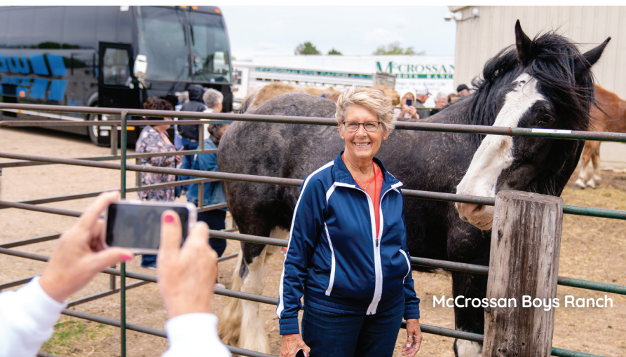
McCrossan Boys Ranch

The arboretum is a serene 155-acre plot, with historic and cultural relevance, colorful remnants, stone quarries, rail lines, building foundations, and more. The tour explains interesting facts about East Sioux Falls' early days and the impact the quarry had on the beginning of what is now Sioux Falls. The Arboretum nurtures connections between plants and people, past and present, in an inspiring natural setting that invites discovery. Time: 40 minutes Admission: Free for group tours; donations of $4 per person encouraged