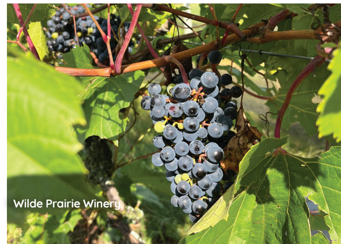
Wilde Prairie Winery