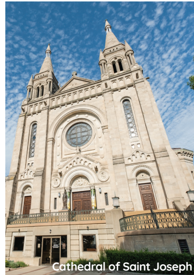
Cathedral of Saint Joseph

The Cathedral of Saint Joseph stands tall above the Sioux Falls skyline. This Romanesque and French Renaissance structure was completed in 1919 and serves as the cornerstone of the Cathedral Historic District. The chief designer of the building was Emmanuel Masqueray, the French architect who also designed the St. Paul Cathedral. A complete restoration took place between 1970 - 1974 and returned it to its original grandeur. Time: 45 minutes Admission: Free; minimum donation of $50 per coach is expected