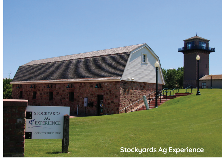
Stockyards Ag Experience

The Stockyards Ag Experience located at Falls Park tells the story of agriculture’s impact in this region and chronicles the life of the former Sioux Falls Stockyards. Vibrant historical images and high-tech interactive displays give the visitor a look inside the world of food production and explain the process of farm to table. Time: 40 minutes Admission: Free for group tours; donations expected