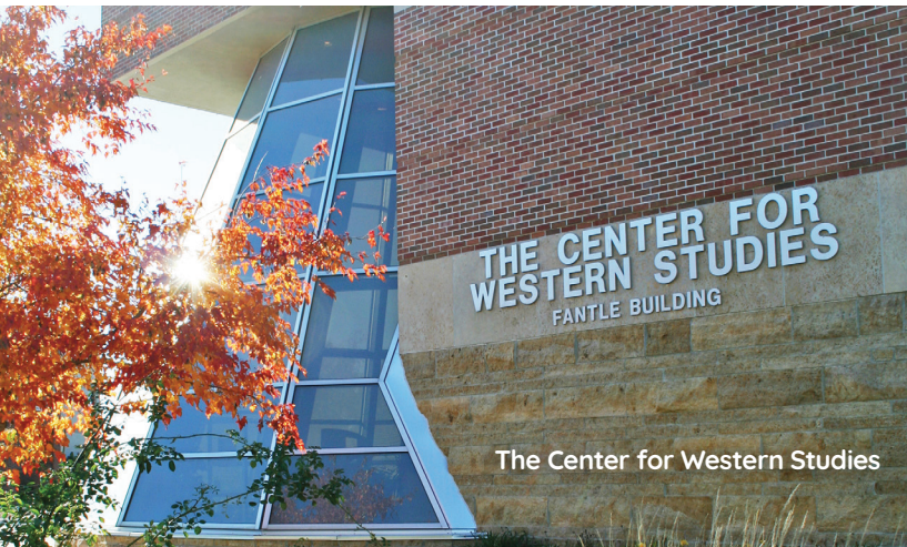
The Center for Western Studies

The USS South Dakota Battleship Memorial features the outline of the USS South Dakota and a museum dedicated to its life in World War II. The USS South Dakota (BB-57) was a battleship in the United States Navy in active service from 1942 until 1947 and is one of the most decorated ships in WWII. Group will be split into two groups. Time: 50 minutes Admission: Free for group tours; donations welcomed