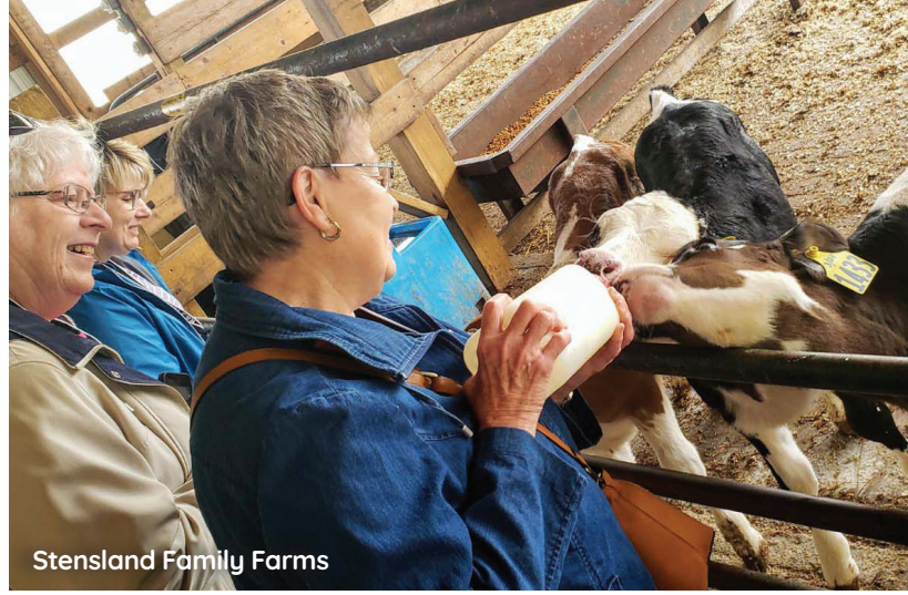
Stensland Family Farms