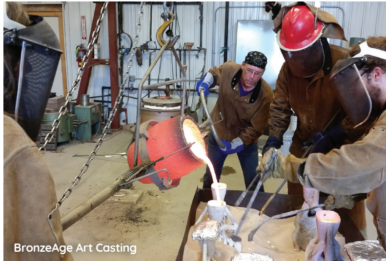
BronzeAge Art Casting

Hot metal. Cool art. It's South Dakota's only sculpture foundry! Full-service art foundry offering bronze, brass, aluminum and iron casting services to artists, architects, designers, communities, and individuals. This working foundry works with artists to create many of the bronze sculptures in the region and across the U.S. The tour takes you into the detailed and tedious process of bronze casting from the first steps of clay sculpture to the molten metal and finally into a bronze sculpture. Group will be split into several smaller groups to adapt to foundry space. Time: 60 minutes Admission: $12 per person