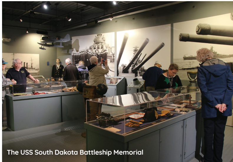
The USS South Dakota Battleship Memorial

"Voices of the Northern Plains" is a dramatic re-imagining of the core museum exhibits in the Center for Western Studies, where visitors travel across 300 years of life in the Northern Plains (1700-2000). The center also hosts 3-4 major art exhibitions every year. The exhibitions feature regional artists and explore themes of importance to the Northern Plains. Time: 45 minutes Admission: Free for group tours; donations encouraged